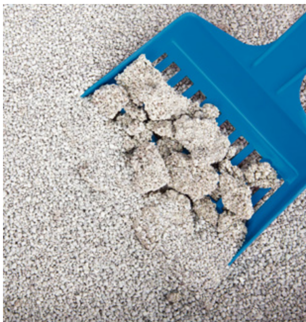
Wood-based pellets with Tylose MH 60000 P6 as clumping additive.